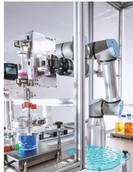
Automated, robot-assisted degradation and analysis of water pollutants.

In ten years, ThWIC will be one of the world's leading centers for water issues: pioneering technology and outreach, with a comprehensive range of data and powerful scientific and commercial offers.