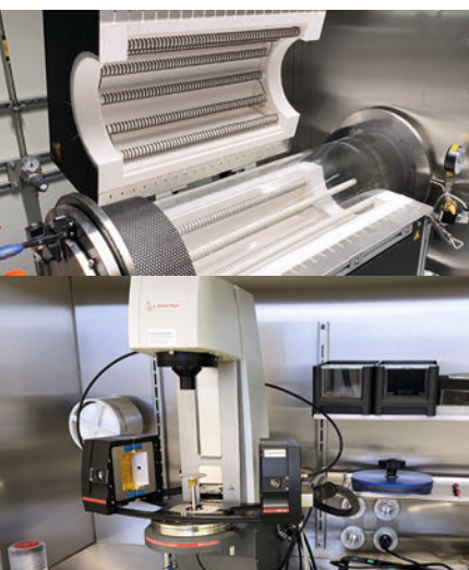
Measuring samples sensitive to moisture and air. Top: Furnace integrated in Ar-Glovebox. Bottom: Rheometer integrated in Ar-Glovebox.