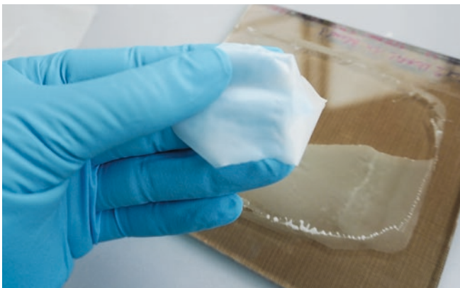
Figure 1: Polymer-Na-β"-alumina composite electrolyte.

With their excellent Na-ion conductivity, solid oxide electrodes made of Na-β"-alumina have for decades represented the state of the art in high-temperature sodium batteries, mainly Na/NiCl 2 and NAS ® . But due to its fracture behavior, it has not been possible so far to use the material in Li-ion cell production techniques. Fraunhofer IKTS, in cooperation with Fraunhofer IAP, has developed a composite electrolyte which combines the high ionic conductivity and chemical resistance of Na-β"-alumina with the flexibility and processability of polymer electrolytes. The advantages of two worlds are thus combined to make Na-β"-alumina usable for all-solid-state cells. The prototype of such a composite electrolyte is shown in the following figures. The ionic conductivities of the developed prototyped are in the range of 10 -4 S cm -1 , looking promising already.