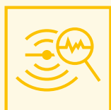
Non-Destructive Testing and Monitoring