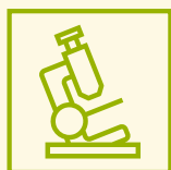
Materials and Process Analysis