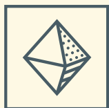
Materials and Processes