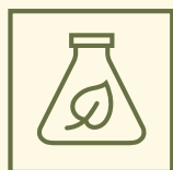
Environmental and Process Engineering