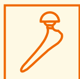
Bio- and Medical Technology