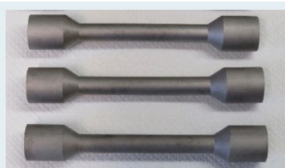
Figure 4: Zirconium carbide heating elements for high-temperature processes.