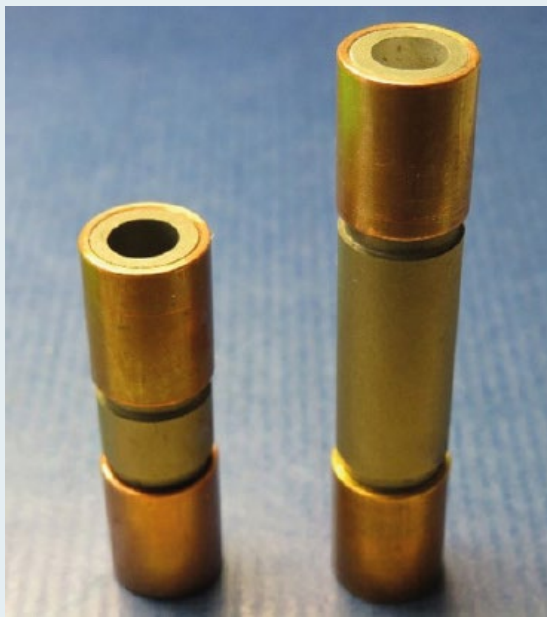
Figure 3: Copper rings as end contacts to zirconium carbide test specimens, shrinkage technique on metallized surface.

By innovative joining technologies, zirconium carbide heating elements can be reliably integrated into the overall system. Alloys based on Fe-Si-Ti that have already been tested allow temperatures at the joining zone of > 1200\text{ }^{\circ}\text{C} . The respective function of the ZrC components defines the requirements for the connection: electrical coupling, thermal insulation or conduction for system components, as well as mechanical stiffeners, supports or delimitations.