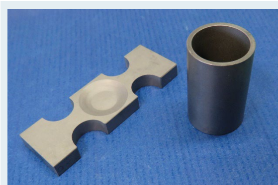
Figure 1: Evaporator and crucible material made of zirconium carbide.

Considering this background, a process was developed by which dense ZrC materials in different geometries can be produced cost-effectively by means of pressureless sintering. The coordinated combination of the technological steps enables the production of large-format ZrC components with a length of more than 250 mm. Plates and rods can also be produced. Such components can be used as electrical heating conductors, thermal protection, fluid lines or structural elements for high-temperature applications and thus improve the operating quality for high-temperature systems.